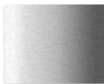
Brushed Chrome Code: 402