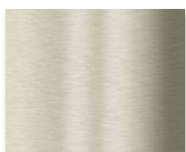
Brushed Nickel Code: 410